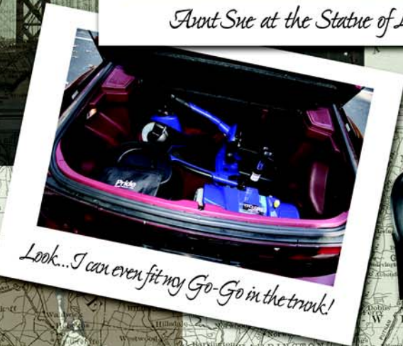
Look...I can even fit my Go-Go in the trunk!